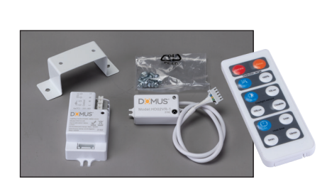
Internal ON/Off Sensor